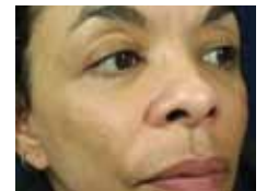
Post 2 treatments