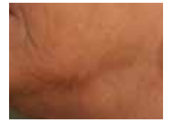
Post 2 treatments