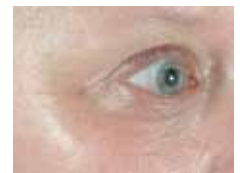
Post 3 treatments