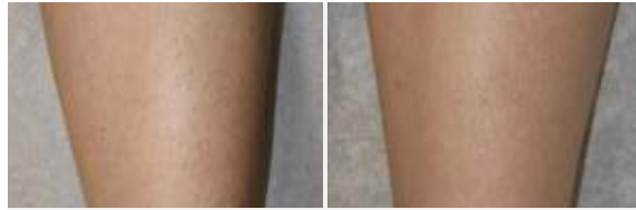
Before After 5 treatments

Remove unwanted hair anywhere on the body!