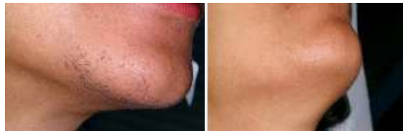
Before After 2 treatments

All photos are untouched. Individual results may vary.