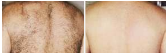
Before After 5 treatments

All photos are untouched. Individual results may vary.